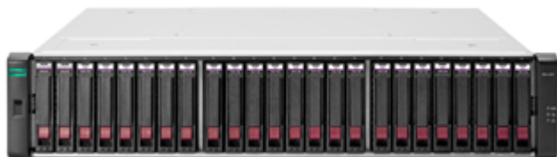
HPE MSA 2042 Storage (SFF)