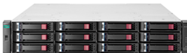
HPE MSA 2042 Storage (LFF)

The MSA 2042 further drives the MSA 2040 family into the world of flash acceleration with a new set of MSA models which includes 800GB of flash capacity in all SFF and LFF configurations. In addition to including 2x400GB Mixed Use SSDs in the base configuration, the MSA 2042 also includes a rich set of software features as standard including 512 Snapshots, Remote Replication and Performance Tiering capabilities, all at a very attractive price compared to other hybrid configurations. The 800GB of SSD capacity can be used as Read Cache or as a start to building a fully tiered configuration. With the inclusion of the Advanced Data Services SW License, customers can choose how to best utilize these SSDs to provide the optimal flash acceleration for their performance hungry applications. Both Read Cache and Performance Tiering utilize a real-time tiering algorithm which works without user intervention to place the most accessed data on the fastest medium at the right time. The MSA 2042 will dynamically move hot pages up to SSD for flash acceleration and move cooler, more stagnant data back down to spinning media as workloads change in real time hour-to-hour, day-to-day, and week-to-week. All done hands free and without any management overhead from the IT manager.